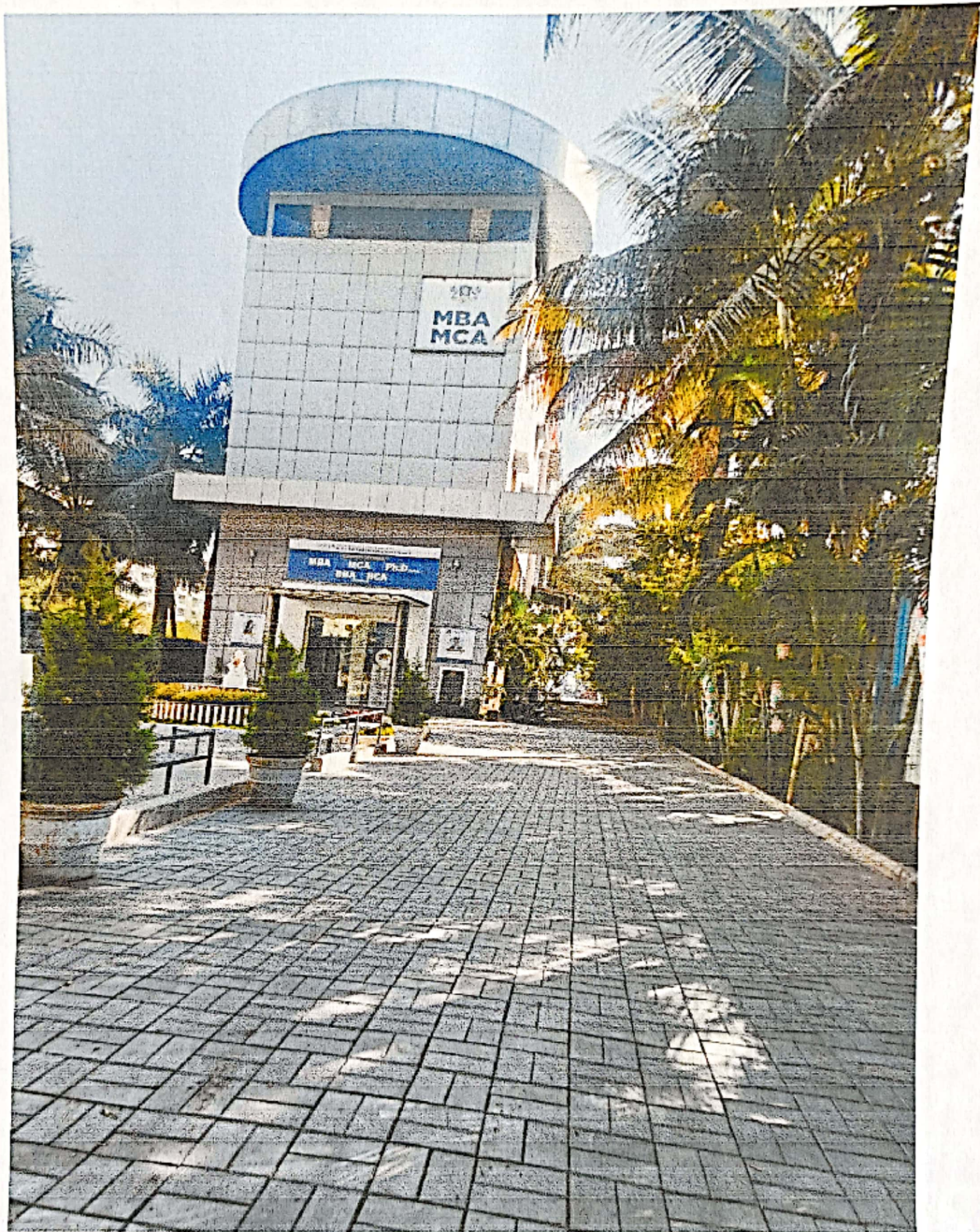
Road structure within the campus